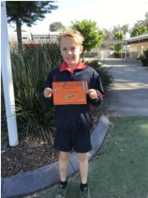
JUNIOR SCHOOL COUNCIL AWARD